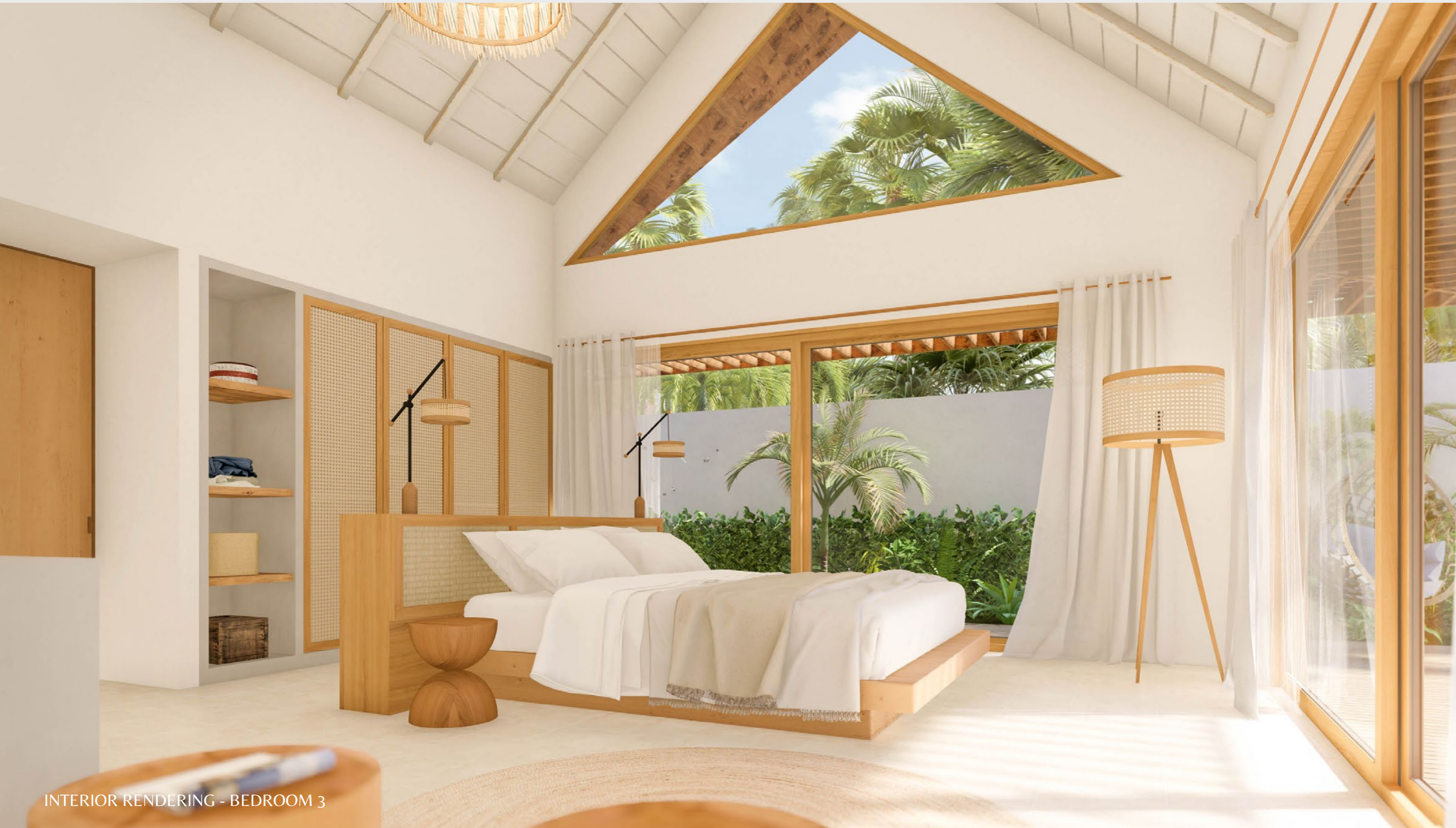
INTERIOR RENDERING - BEDROOM 3