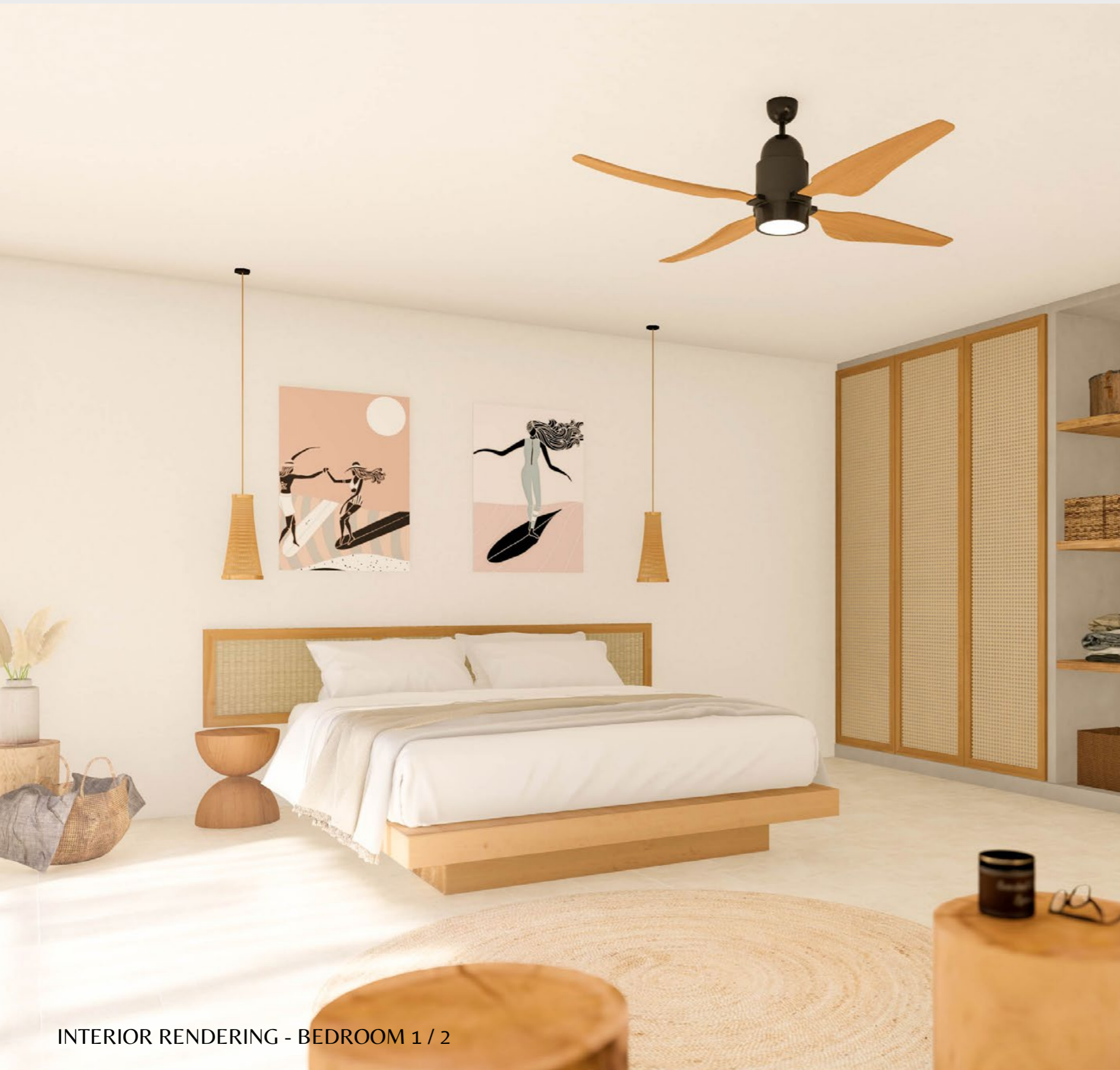
INTERIOR RENDERING - BEDROOM 1 / 2