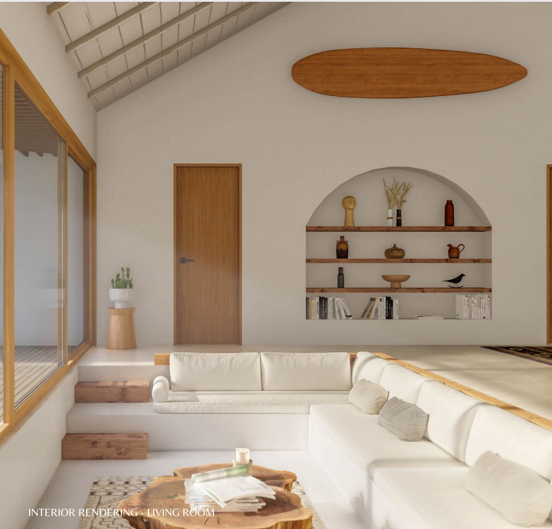
INTERIOR RENDERING - LIVING ROOM