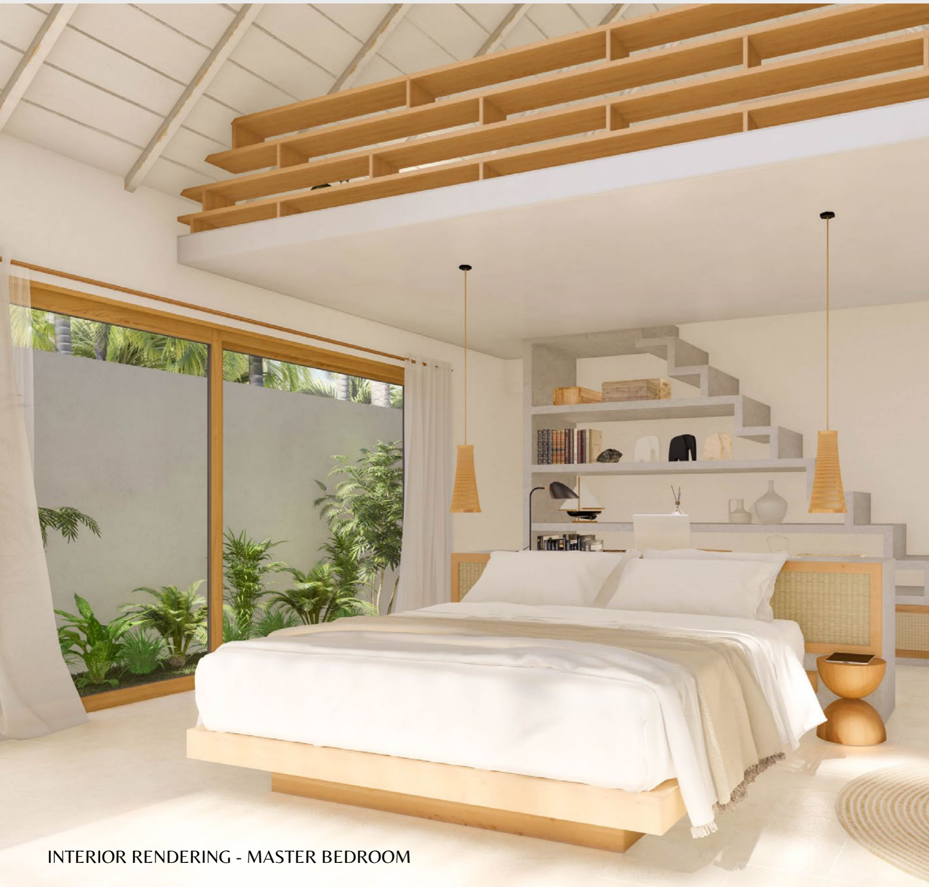
INTERIOR RENDERING - MASTER BEDROOM