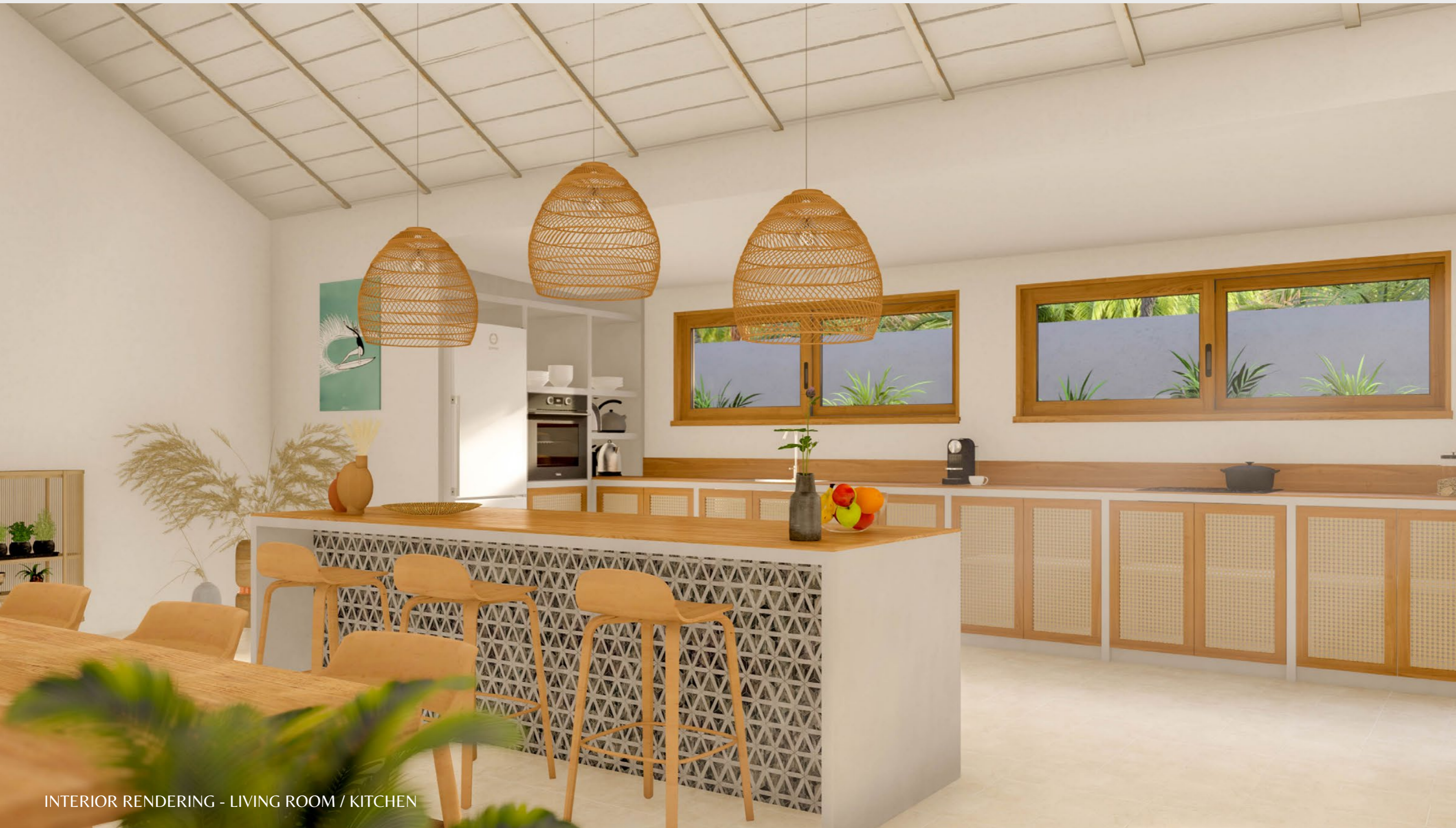
INTERIOR RENDERING - LIVING ROOM / KITCHEN