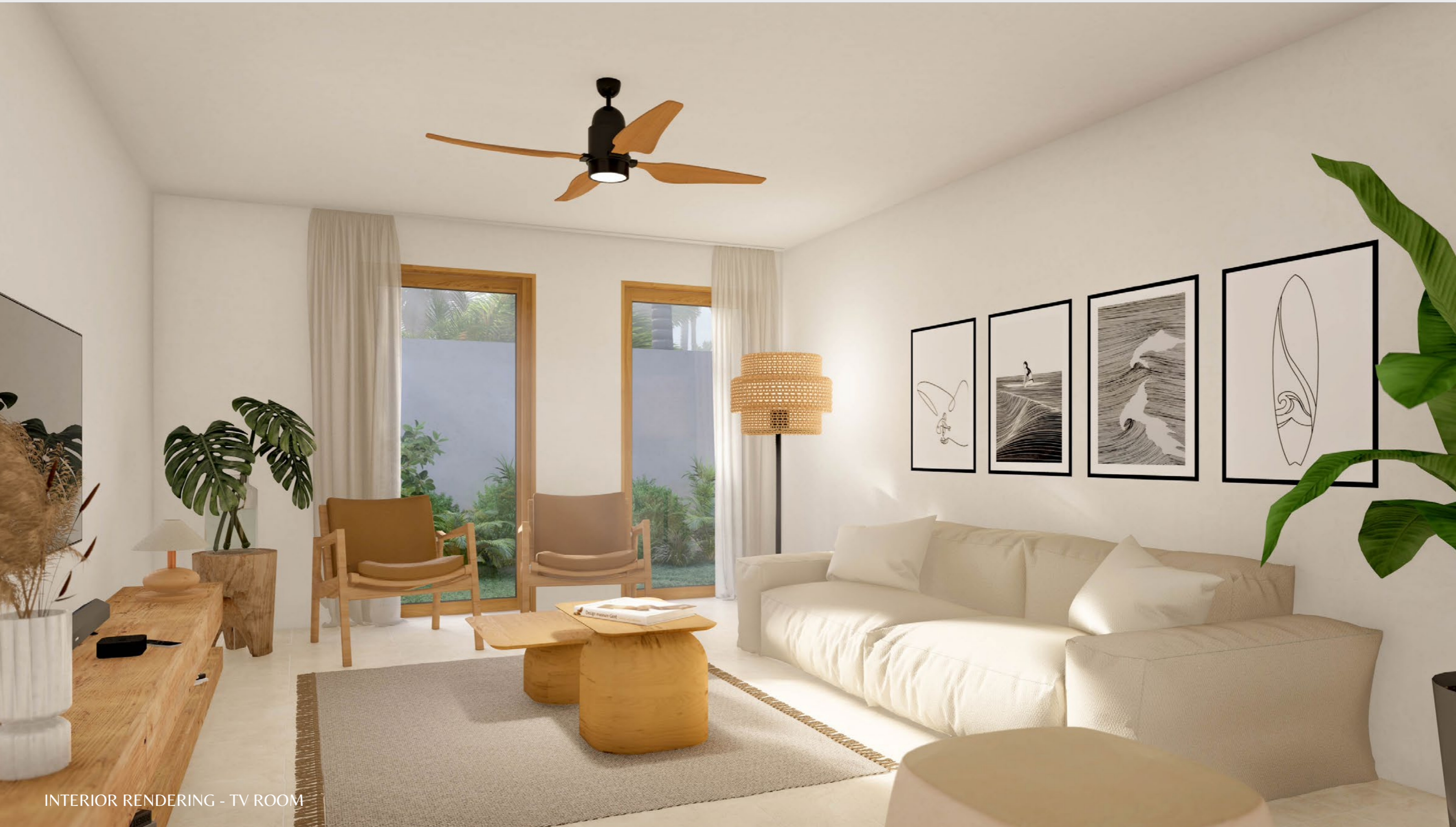
INTERIOR RENDERING - TV ROOM