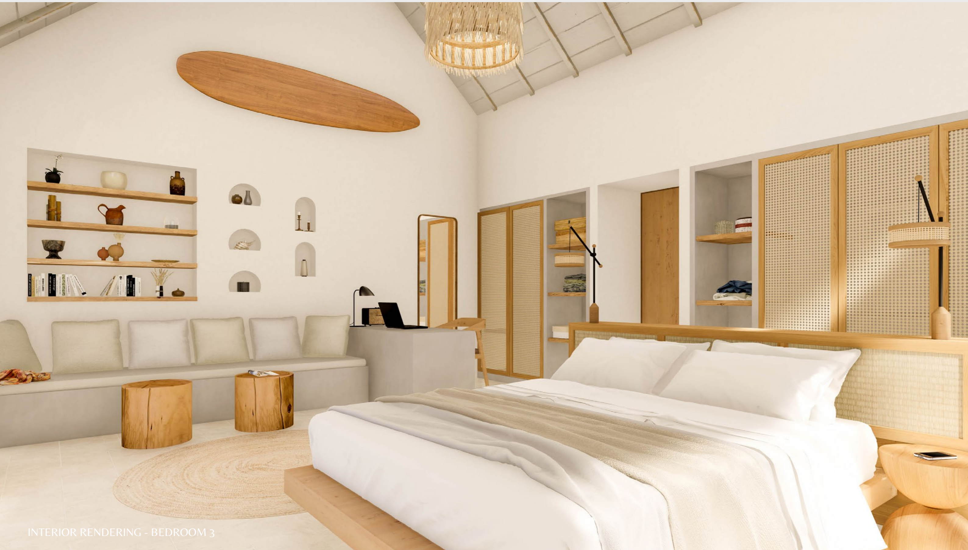
INTERIOR RENDERING - BEDROOM 3